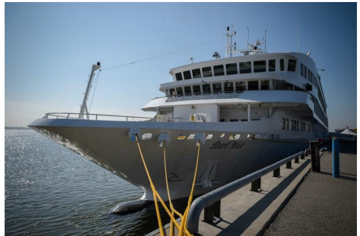
M/V Pearl Mist

On May 16, the cruise ship Maasdam, arriving from Fort Lauderdale, Florida, stopped over in Trois-Rivières with over 1,200 passengers and 500 crew. It was followed by the Pearl Mist in September and the Silver Whisper in October.