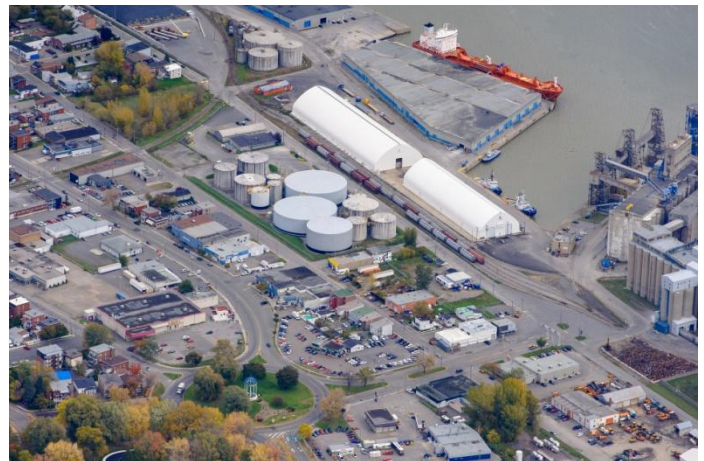
Warehouse 16 (2 nd megadome) completed in July 2014