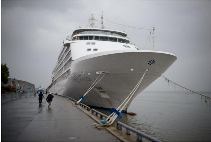
M/V Silver Whisper