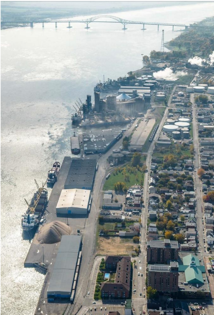
The Port of Trois-Rivières in 2009