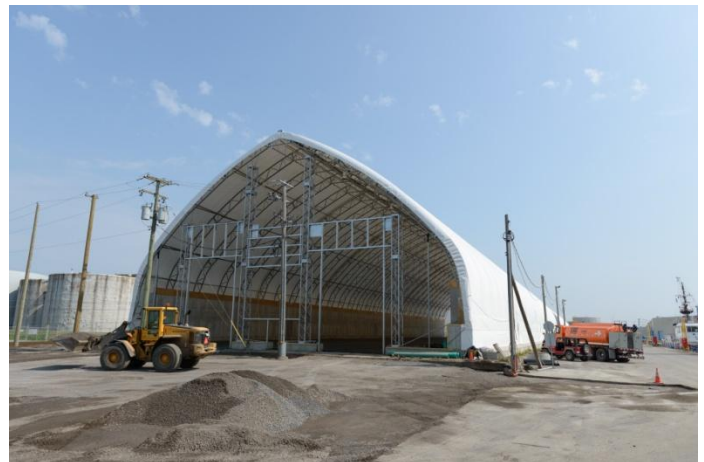
Construction of Warehouse 16

The TRPA has already carried out work related to this second phase of On Course for 2020 : the construction of Warehouse 16, a megadome used by Somavrac for storing solid bulk.